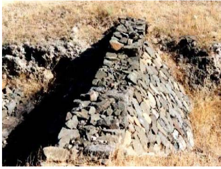
(a) Gully plugs along drainage line